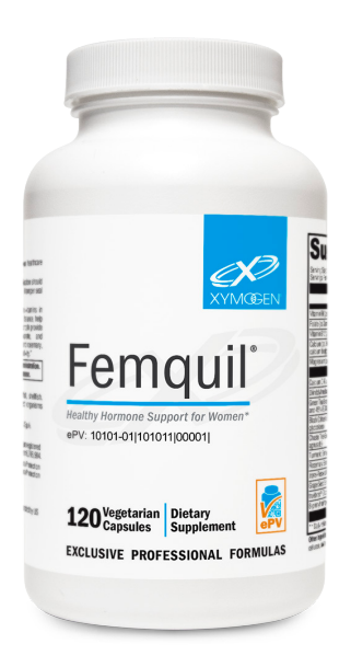
Available in 120 vegetarian capsules