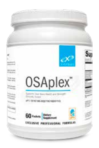
OSAplex<sup>™</sup> and OSAplex MK-7<sup>™</sup> are available in 60 packets