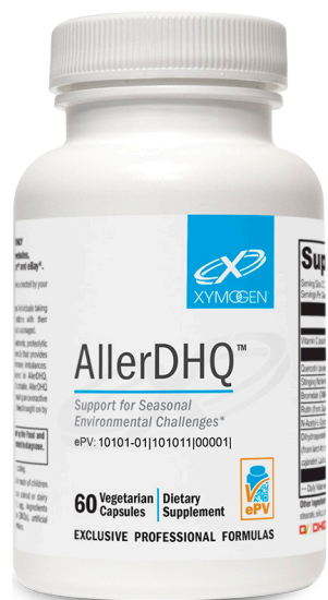
Available in 60 capsules

Support for Seasonal Environmental Challenges*